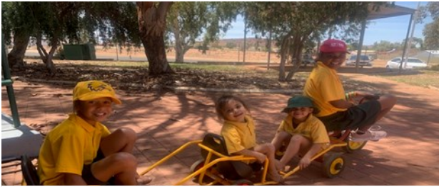
Fun on the bicycles!