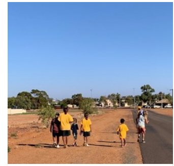
Morning Walk about