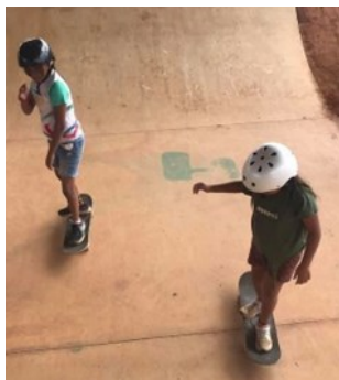
Our youths even got the chance to try skateboarding in Mount Magnet, how exciting!